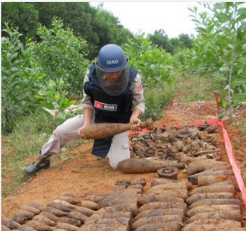
Above: A MAG deminer carefully removes more than 200 items from a UXO 'dumping' area in Quang Tri province