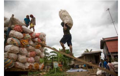
A truck in Ou Chamlong village being loaded with fresh produce.

Ou Chamlong’s village chief, Kim Chin, says that development in