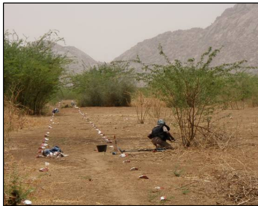
A deminer works on the final stages of Minefield 205 in Al Lafa

MAG has continued to execute operations to the highest standard and of the five external QA checks that were done this month, three were graded as high and two were graded medium.