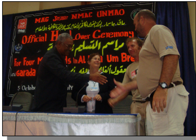
Director of NMAC, Dep Director UNMAO, MAG TFM Team Leader and TFM's sign hand over documents at the Official Handover Ceremony on 29 July 2009