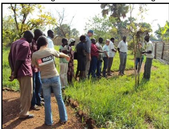
GTZ receive MRE at the MAG mine/UXO recognition garden in Yei, June 2010

MRE for NGOs: MAG launched a “Working and Living Safely in Sudan” initiative offering all NGOs in Sudan targeted Mine Risk Education (MRE) for their staff. In May, MAG provided MRE to GOAL, Danish Refugee Council, UN Joint Logistics Centre, Concordis International, CAFOD and Action on Disability for Development (ADD), during a session held in Khartoum. MAG will provide more MRE to staff of GOAL and Samaritan’s Purse in Kassala during August. MAG has provided MRE to GTZ at the Yei base mine/UXO recognition garden, and to Merlin in Juba, with future sessions planned for Mercy Corps, Non Violent Peace Force, CHF International, American Refugee Council and further sessions for GTZ. During the MRE session, participants learn how to identify potentially dangerous areas, recognition of international and local warning signs, and safe behaviours. MAG is delighted to support other NGOs in this way, and will continue to offer complimentary MRE to all organisations in MAG’s geographic areas of operations in Sudan.