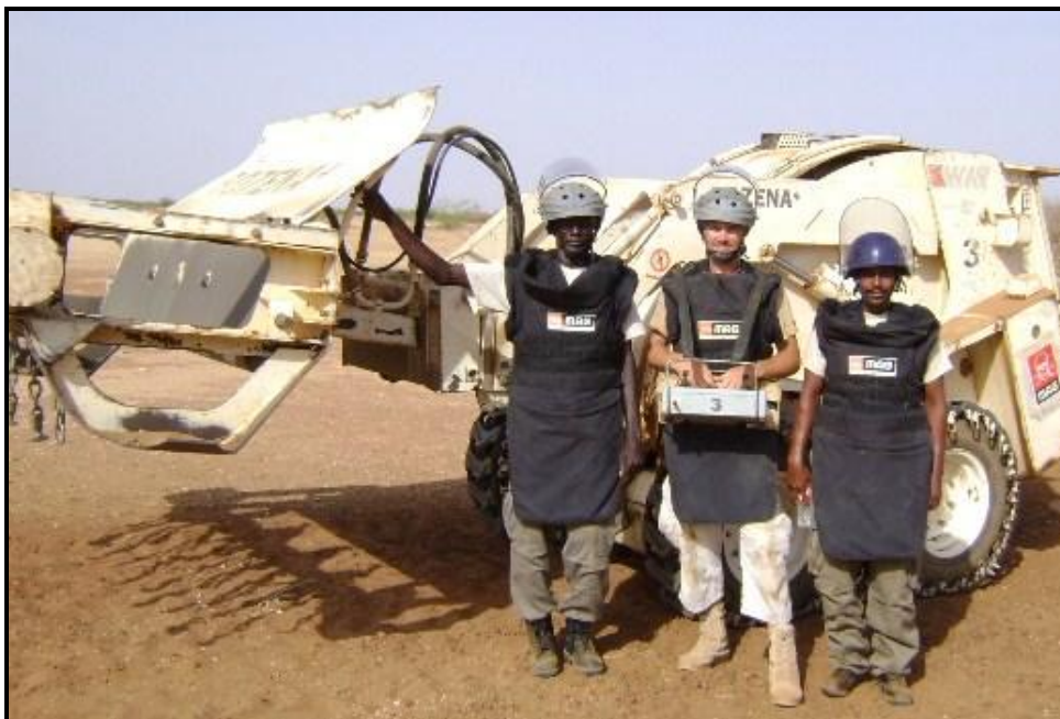
Above: MAG mechanical operator (centre) with the two JIDU trainees standing next to the Bozena IV mini-flail in Kassala, Northern Sudan