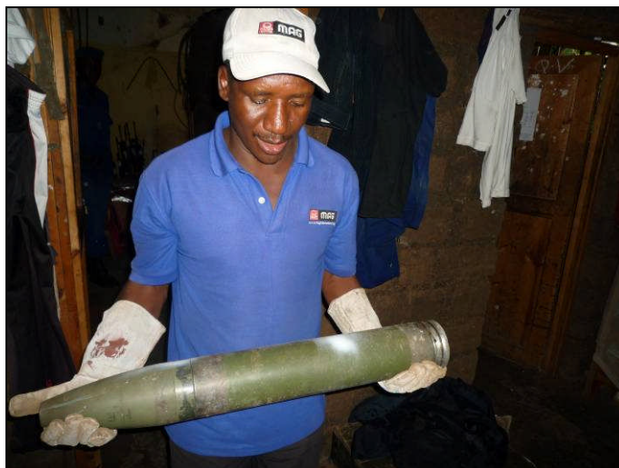
An EOD operator from the MAG-PNB mobile team collects a rocket which has been handed-over to the CDCPA, Bujumbura Rural.