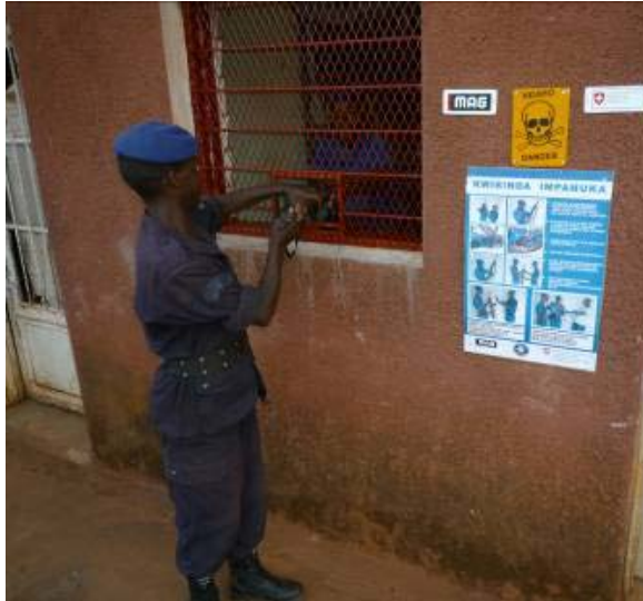
BURUNDI - PNB officer collecting his weapon from the armourer through the hatch installed by MAG, Police Region South