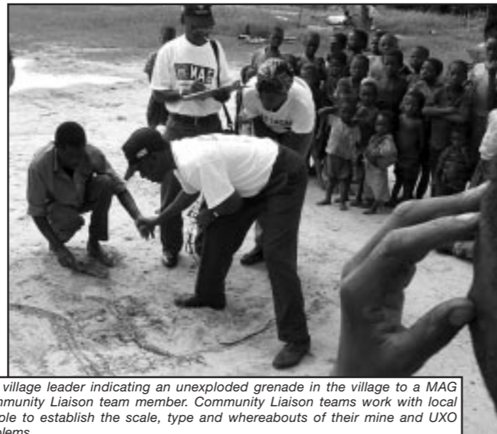
The village leader indicating an unexploded grenade in the village to a MAG Community Liaison team member. Community Liaison teams work with local people to establish the scale, type and whereabouts of their mine and UXO problems.

Watch out for the next 'Live' project from Cambodia on the web from the 25th February to 3rd March.