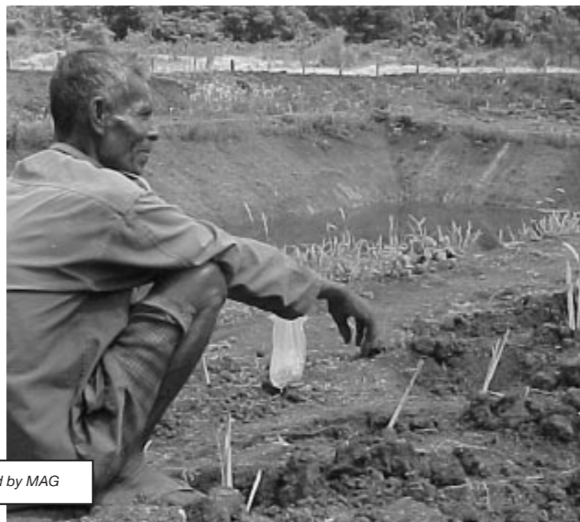
The village water pond, cleared by MAG